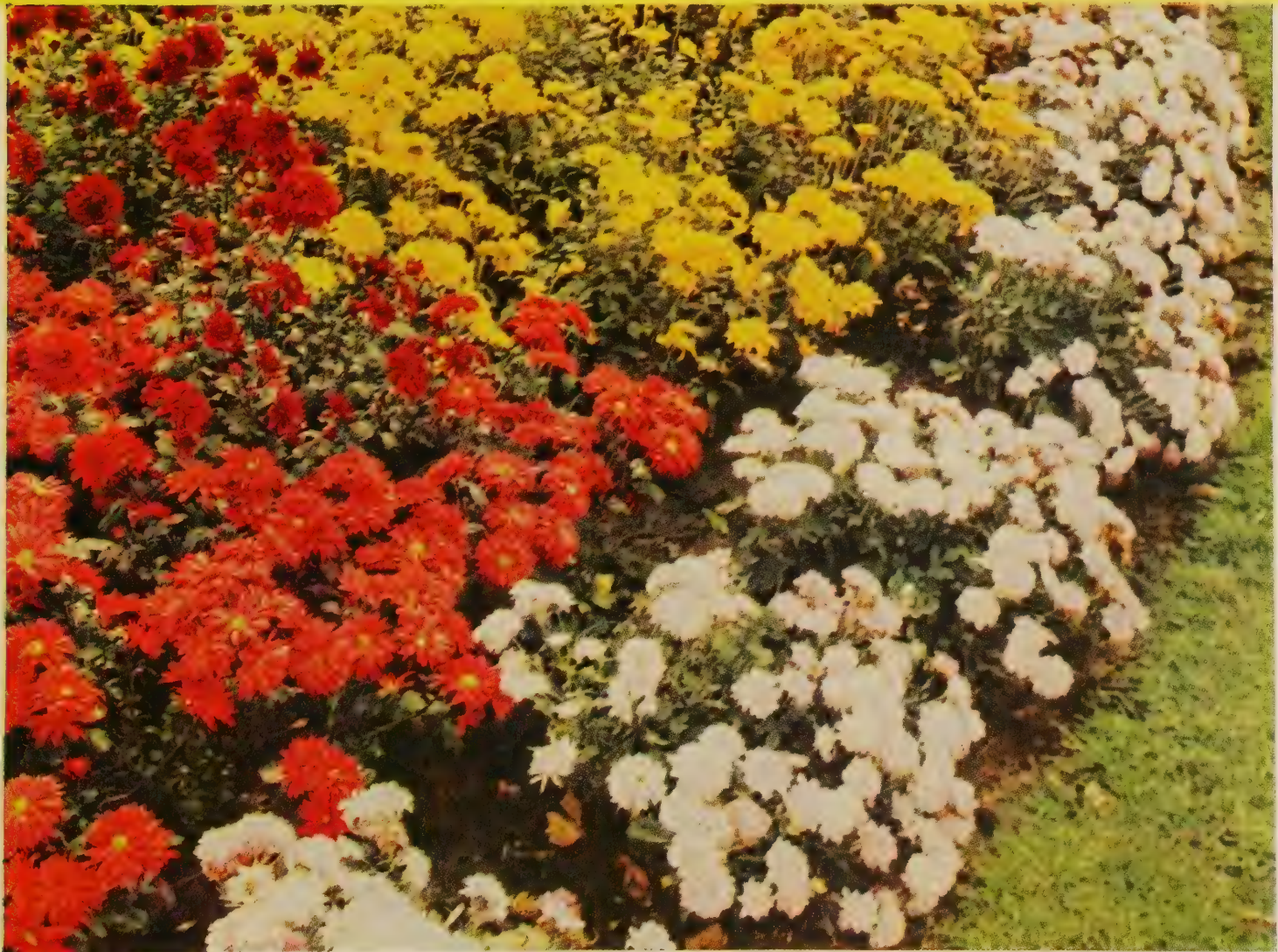
A PLANTING OF CUSHION MUMS